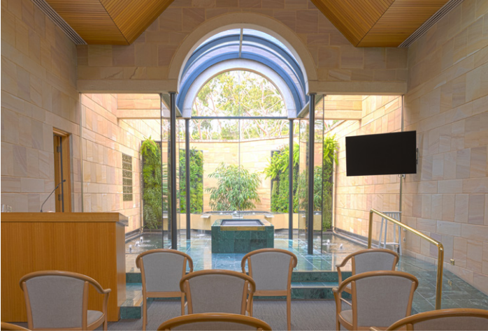
The Mawson Intimate with seating for up to 30 people

Together with our family and friends, funeral and memorial services help us to express our deepest thoughts and feelings about the life of a loved one. Overlooking picturesque gardens our Jubilee Complex and new Function Rooms offer a range of unique venues tailored to suit the varying needs of families.