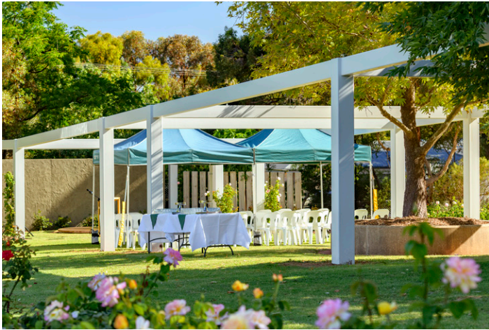
Garden Services Comfortably seats up to 100 people